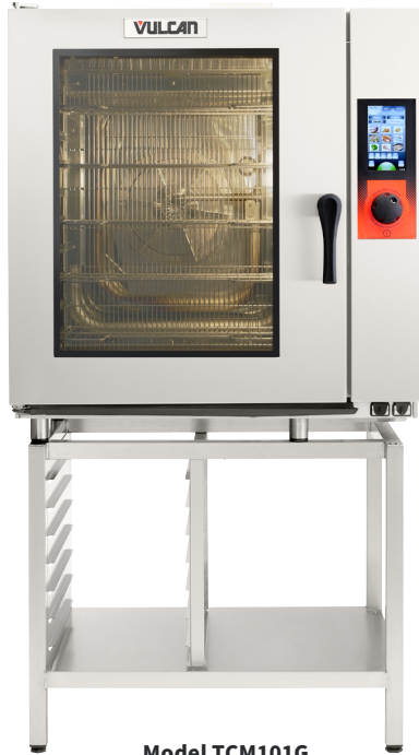
Model TCM101G Shown on optional stand